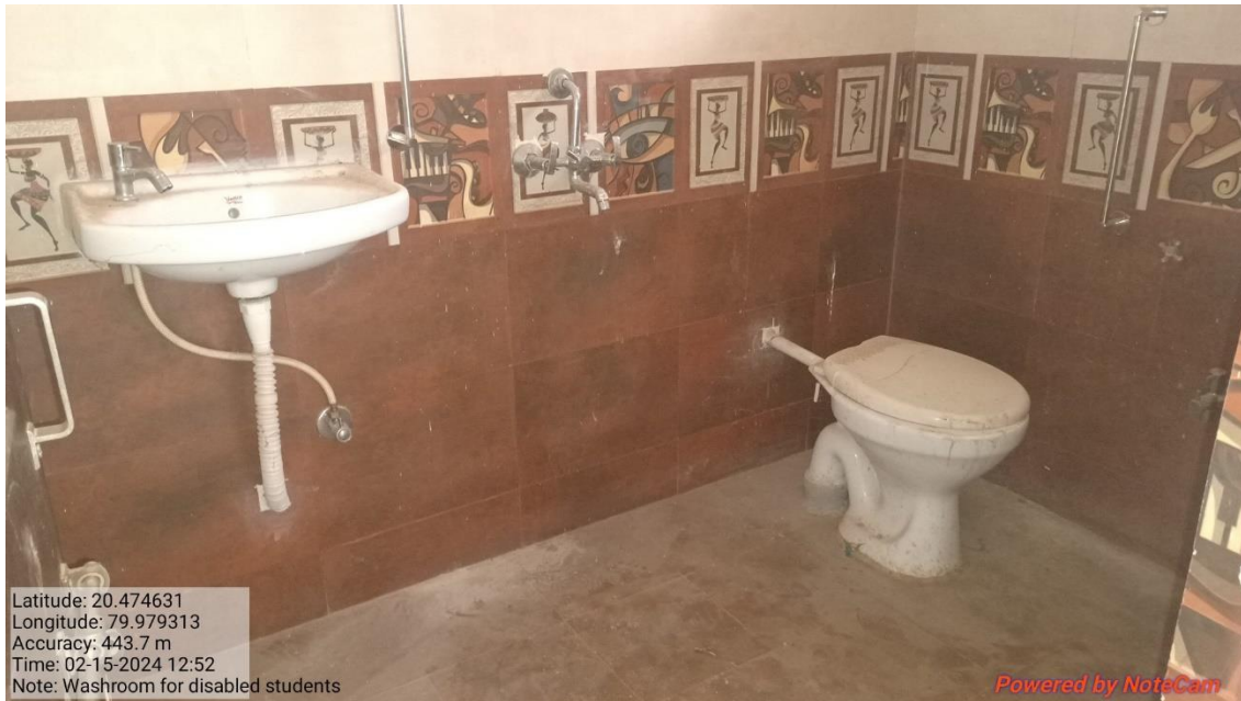
Disabled friendly Washroom