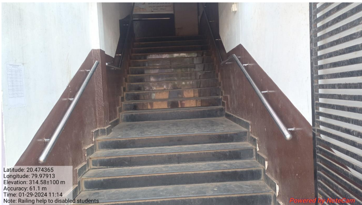
Railing help to disabled students